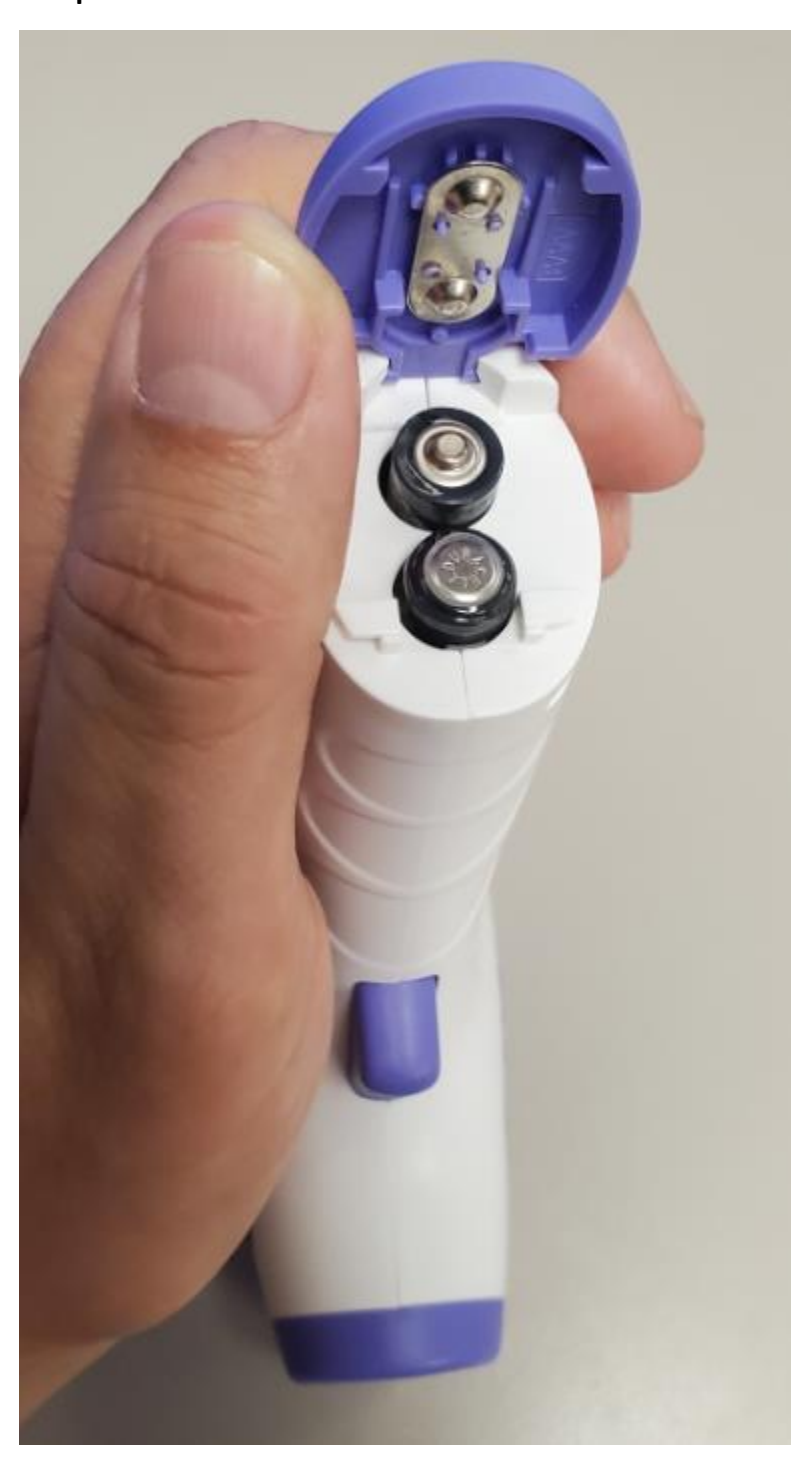
Step 2: Once door is open place one AAA battery with the positive side up in the slot closest to the hinge of the door. Place the second AAA battery with the negative side up in the next slot. Close battery compartment door

Step 1: Turn Thermometer over and with your thumb slide forward the battery compartment door